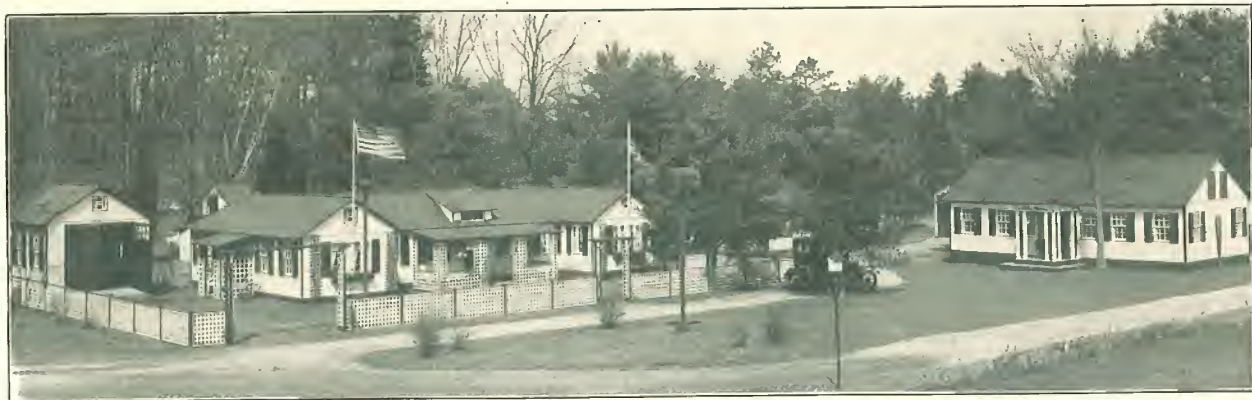
Outdoor Exhibit of Hodgson Portable Houses at Dover, Mass.

Thirty years ago we started in a humble way in a small shop. Today we have a spacious, daylight factory equipped with the most modern machinery and operated by men who have made portable houses a life-long study. With this equipment and training, the houses we are able to turn out have won for us an undisputed reputation for being practical, durable and artistic, with a decided sense of individuality and refinement that appeals to all who appreciate these qualities. The fact that 75 per cent. of our business each year comes through customers who have used our houses for years, proves that our efforts in building a portable house with these features have been appreciated. They are to be found on the finest estates in this country, being used for cottages, garages, playhouses, garden houses, overflow houses, poultry houses, etc. Send for our Catalog. It tells you all.